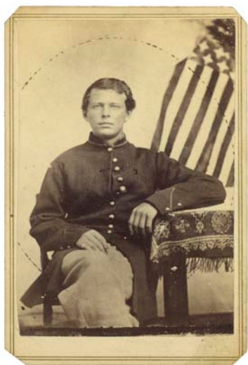
Figure 6-Unknown Enlisted Infantry (76)