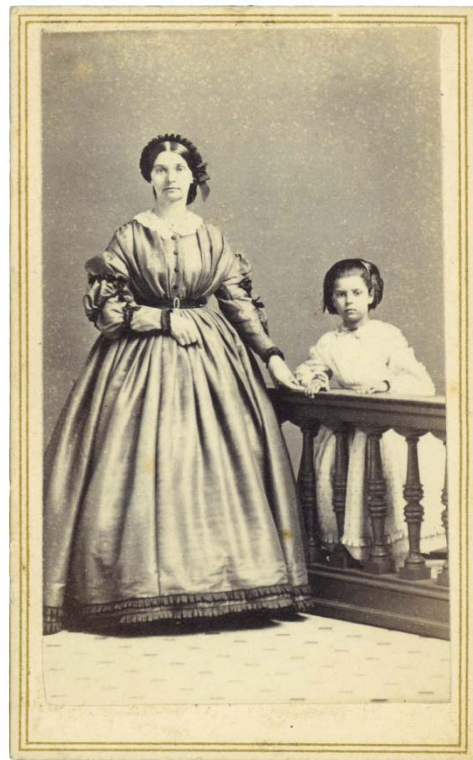
Figure 4-Unknown Misc. 13-Woman and Girl