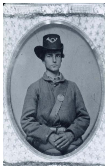
Figure 7-Unknown Enlisted Infantry (107)