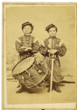
Figure 8-Unknown (Miscellaneous 6) drummer boys

Author Houston, Henry Clarence, 1847- Title The Thirty-second Maine regiment of infantry volunteers; an historical sketch / by Henry C. Houston . Publisher Portland, Press of Southworth Brothers, 1903 Call No. : 973.7441 I32h 1903