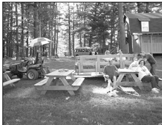
Relaxing & waiting for the next hay ride

This year's theme was "A Holiday Every Day" featuring a different holiday for each day of the week. There were activities for everyone, tractor hayrides, boat rides, fishing trips, swimming, t-shirt tie-dying, and arts & crafts and even a campfire with s'mores! Campers made photo albums for themselves to bring home the great memories. ASL News met one night and Peer Support Group on another. Everyone was very busy and very happy!