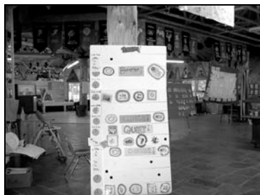
Daily activity sign for campers

Once again people gathered at Camp Cobbossee on Lake Cobbosseecontee in Monmouth for good times with friends, staff, signers, and gesturers of all kinds. It was a five-day overnight camp program for deaf adults with cognitive disabilities. One thing that was new this year is that the camp went from Wednesday to Sunday, which made it easier for people to volunteer. It was great to see old and new friendly faces and smiles. Campers came from all over, some from Lutheran Social Services homes, Goodwill Industries homes and private homes around the state. Approximately forty campers with sixty staff members attended and enjoyed the week-long event.