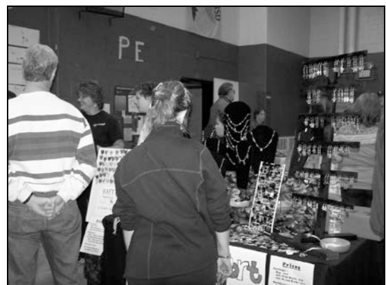
Lisbon High School display table

The evening ended with a Dance Party. A live disc jockey played “dance beat” music and ear plugs were given out to our hearing friends in the audience. Smile.