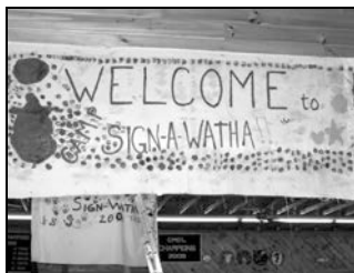
Welcome sign for camp

Once again people gathered at Camp Cobbossee on Lake Cobbosseecontee in Monmouth for good times with friends, staff, signers, and gesturers of all kinds. It was a five-day overnight camp program for deaf adults with cognitive disabilities. One thing that was new this year is that the camp went from Wednesday to Sunday, which made it easier for people to volunteer. It was great to see old and new friendly faces and smiles. Campers came from all over, some from Lutheran Social Services homes, Goodwill Industries homes and private homes around the state. Approximately forty campers with sixty staff members attended and enjoyed the week-long event.