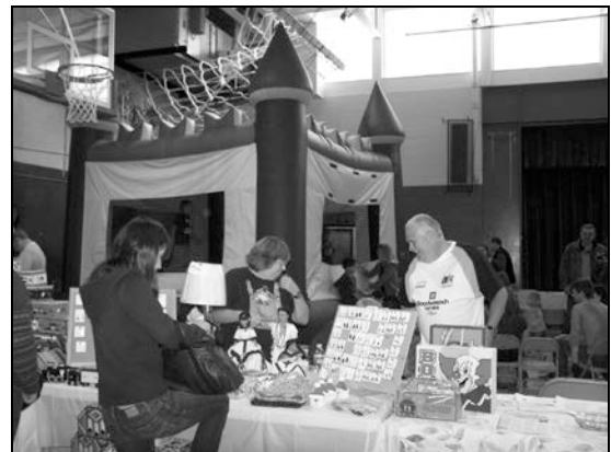
Display table at the festival

There were display tables from MANY organizations, too many to mention them all! In the afternoon, they had workshops taking place for people who were interested. Examples of the workshops were Managing your Money, Employment, Adaptive Equipment, Deaf Pride, and Deaf community and interpreter’s discussion. They even had an Interpreter Auction. Interpreters “sold” two hours of their time to provide interpreting services to the winning bidder.