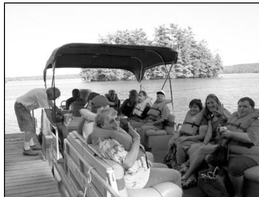
Campers & Staff headed out for a boat ride