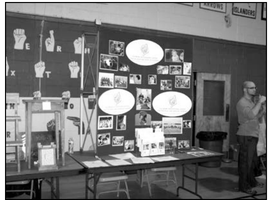
Maine Educational Center for Deaf & Hard of Hearing display table.

The food was fantastic again this year. Pizza Hut donated half their profits back to the Festival. Poland Spring gave out free water, and the ice cream social in the afternoon was yummy.