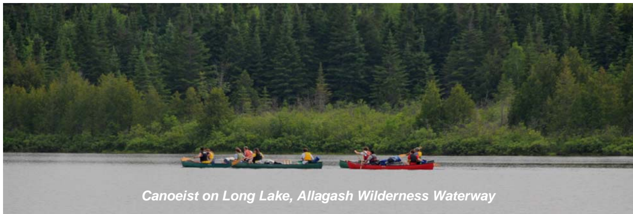
Canoeist on Long Lake, Allagash Wilderness Waterway

The commissioner shall report on or before March 1st of each year to the joint standing committee of the Legislature having jurisdiction over conservation matters regarding the state of the waterway, including its mission and goals, administration, education and interpretive programs, historic preservation efforts, visitor use and evaluation, ecological conditions and any natural character enhancements, general finances, income, expenditures and balance of the Allagash Wilderness Waterway Permanent Endowment Fund, the department's annual budget request for the waterway operation in the coming fiscal year and current challenges and prospects for the waterway.