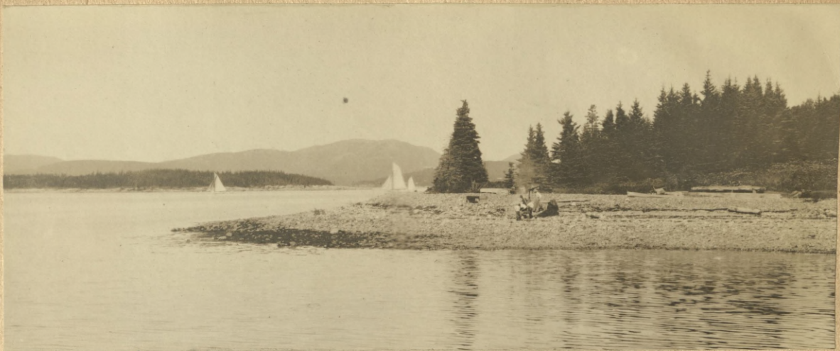
View from Museum north towards "Sutton's", "Largest", and Seal Harbor.