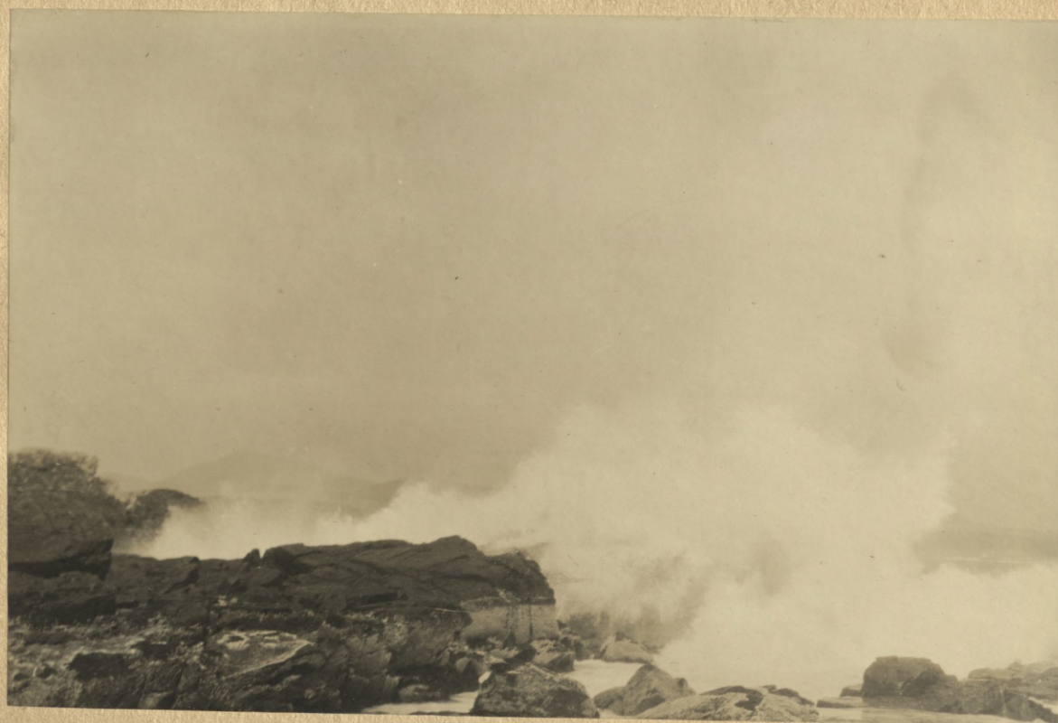
Surf at Lalesford.