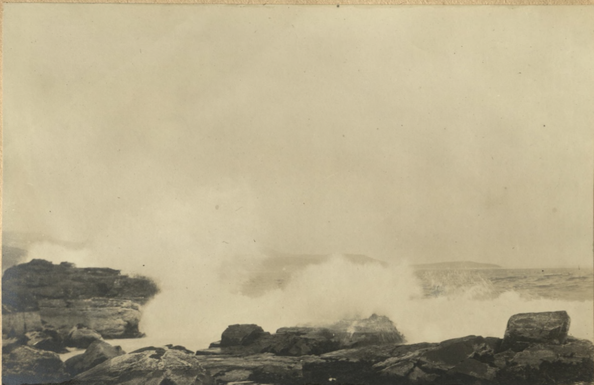
Surf from "Marsh Head" Lilacford.