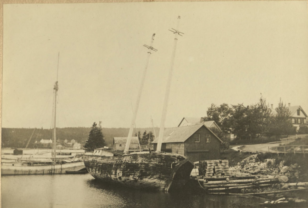
Wharves at Little West Harbor. N. H. Desert.