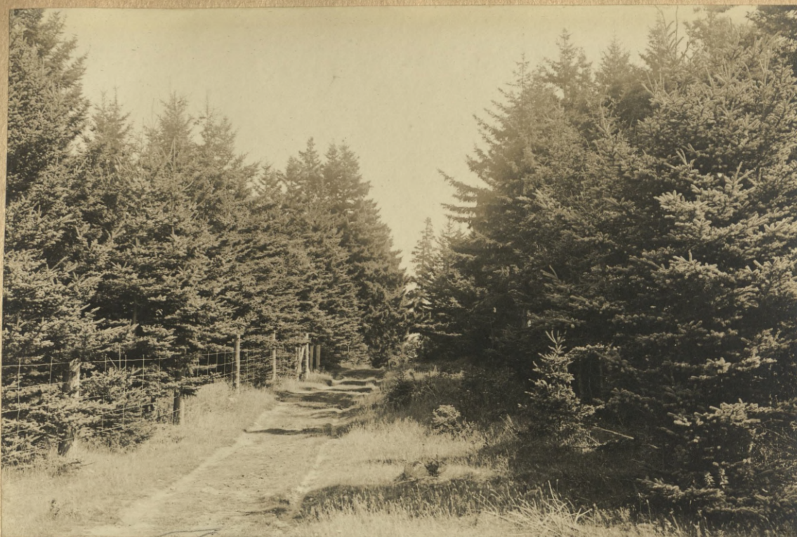
"Wuthwood Road" leading to "Tree Top".