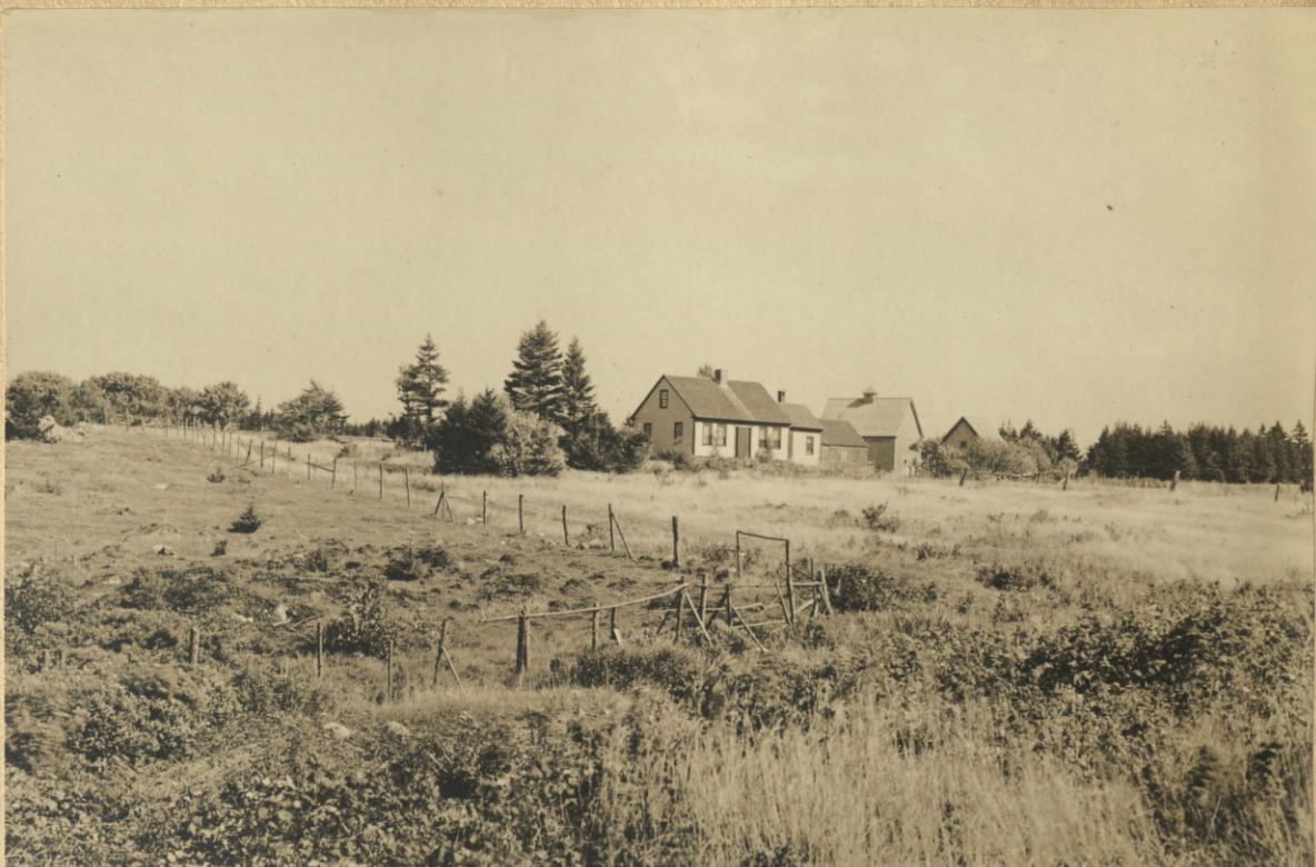
Old Sam Gilley House.