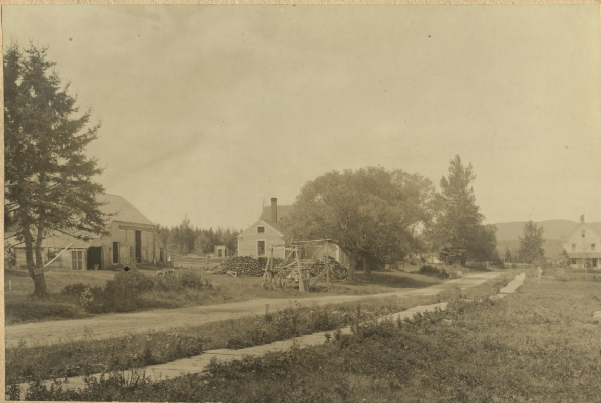
Manet; Ev. West Harbor. N. H. Desert.