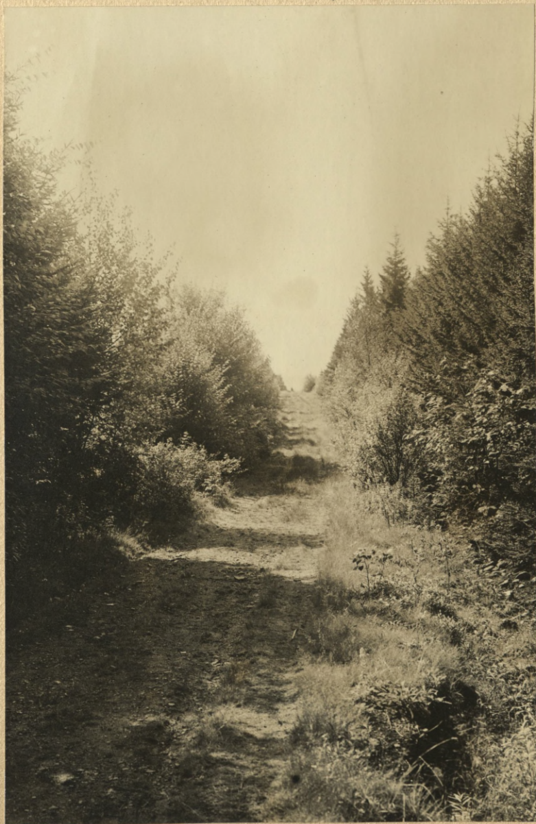
Path to Gilley Beach.