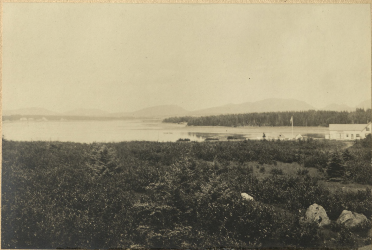
"The Pool" from Hamner's; "Highlandburg" Int. Desert. (north)