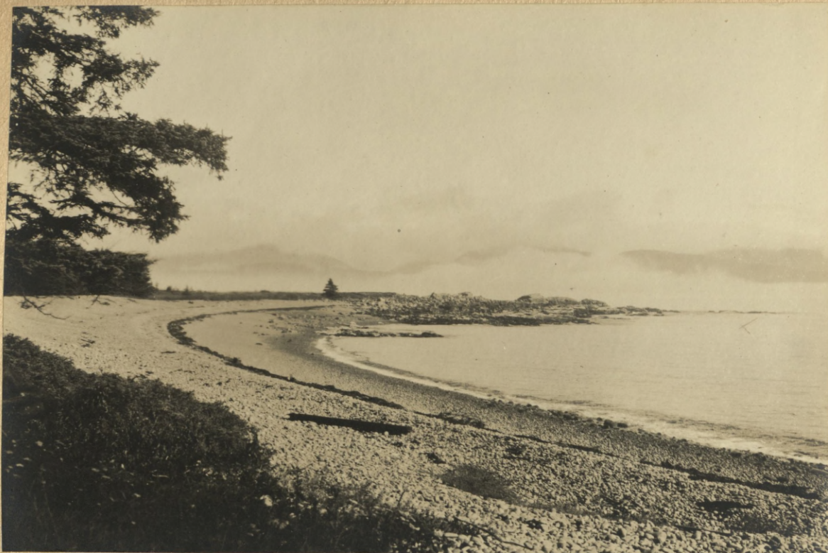
"Hillström" ("Gay's") "Point". "Bunker's Head". "Salisbury". Nob. Desert (Malth)