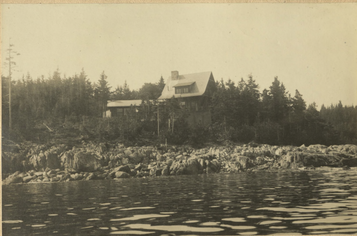
"Tree Top" from the water (east side)