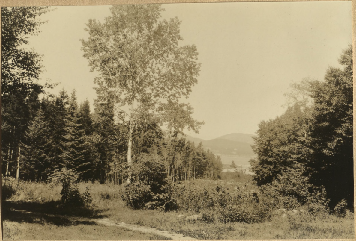
View north from Dovelby's house. (1916)