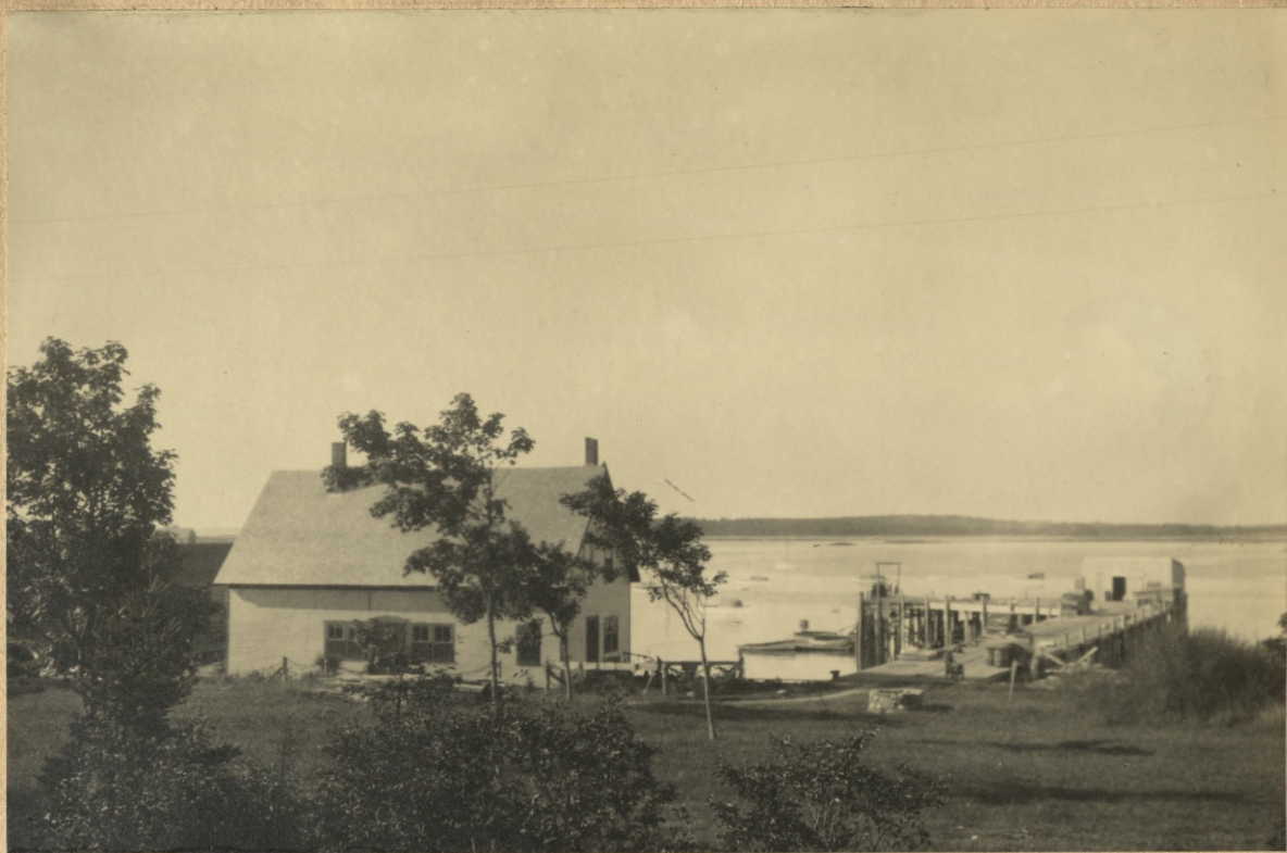
The dock at Islesford. Museum & Artist's Studio.