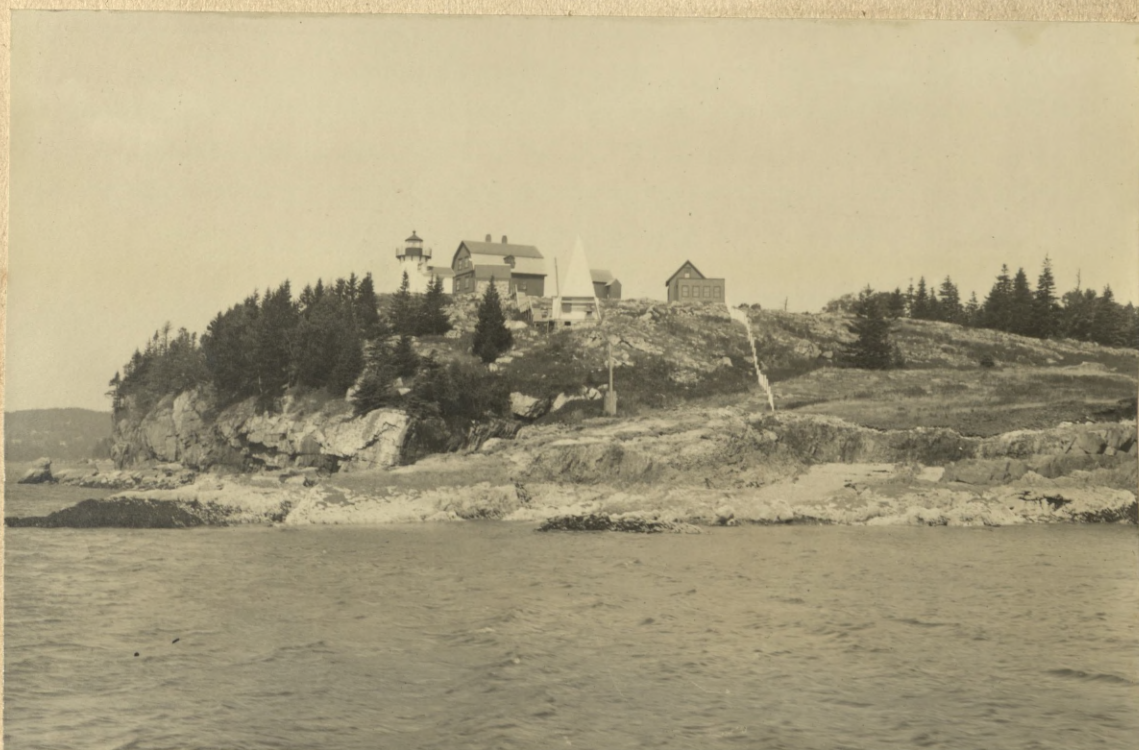
Bear Island. Mt. Desert.