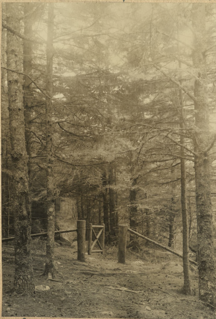
Shore Path at "Tree Top".