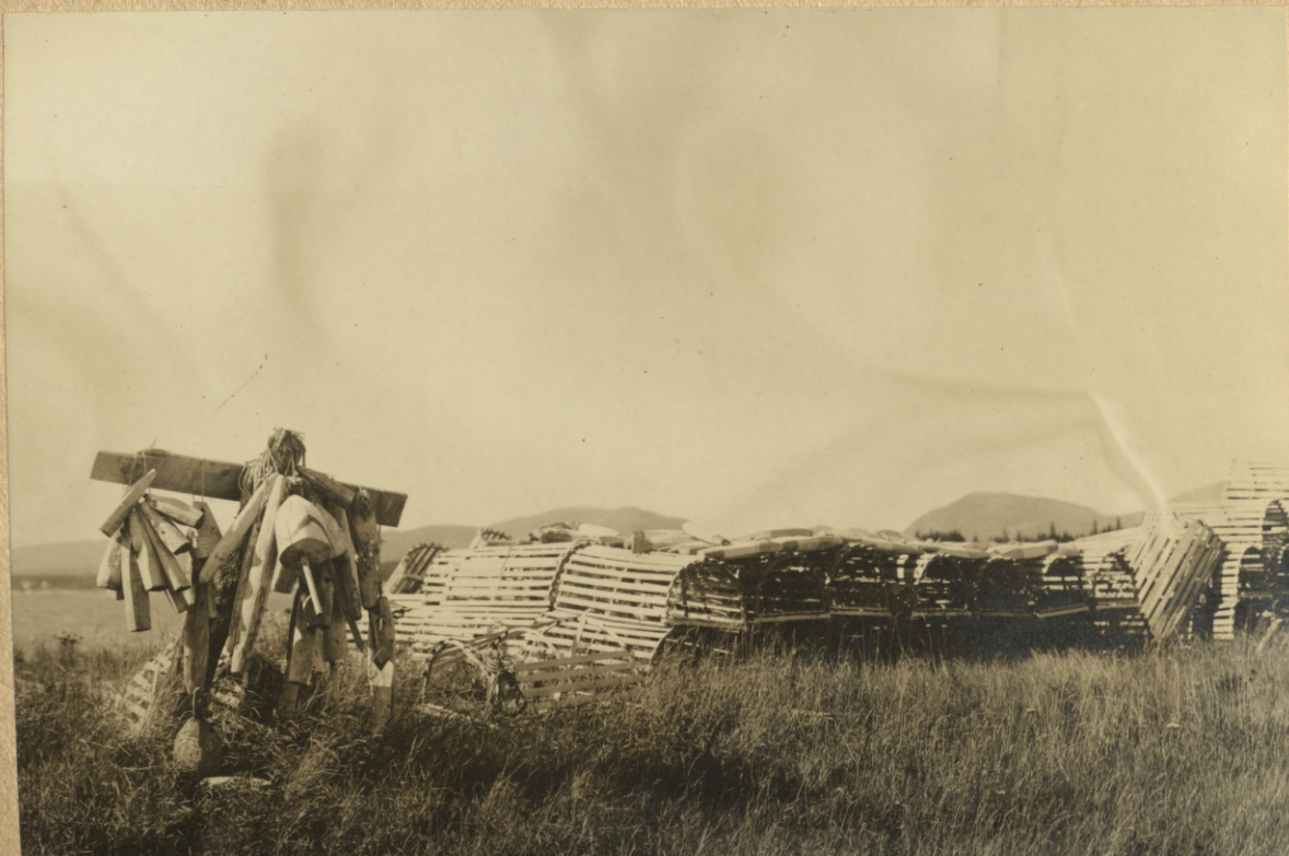
Log Pile at Isleford