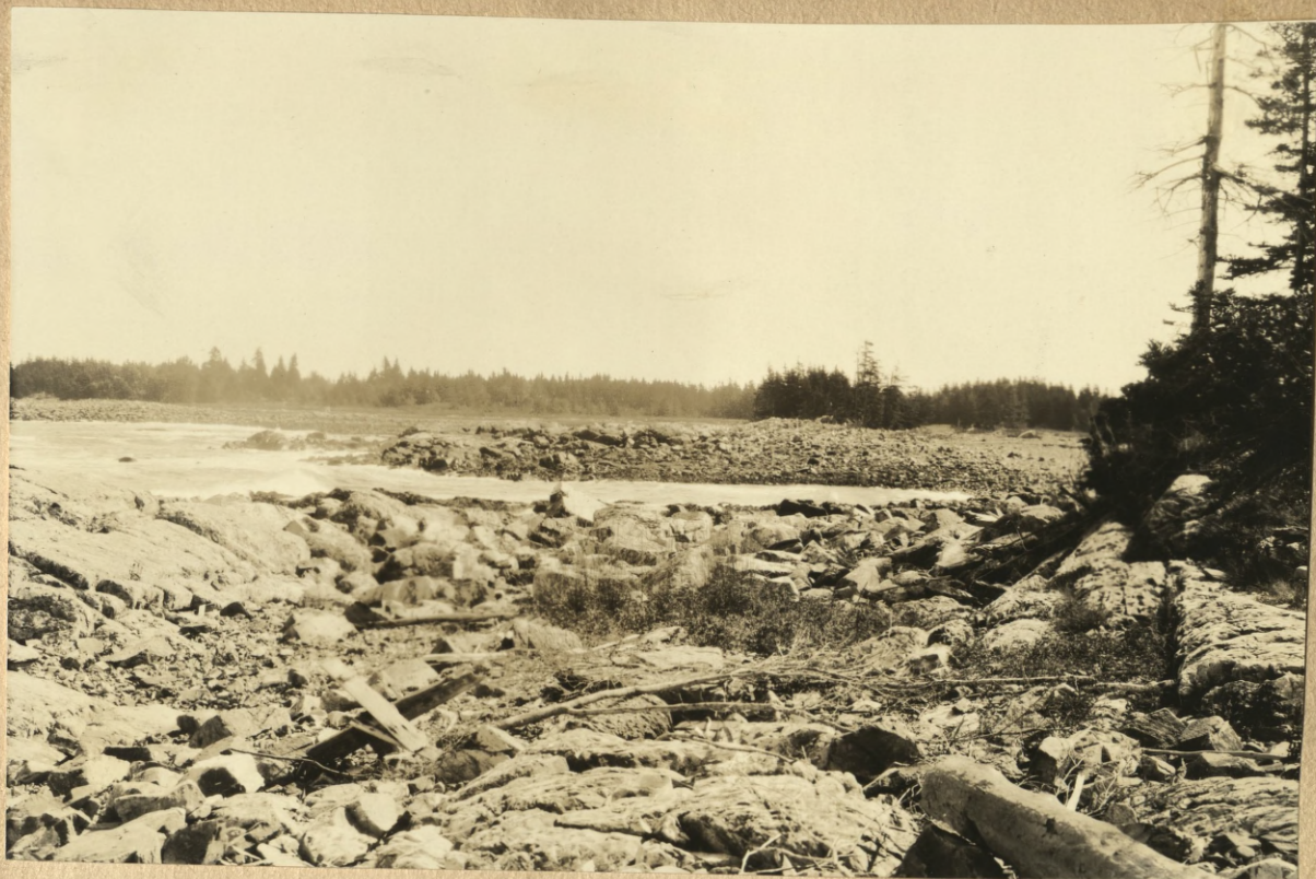
On the way to Marsh Head, north shore.