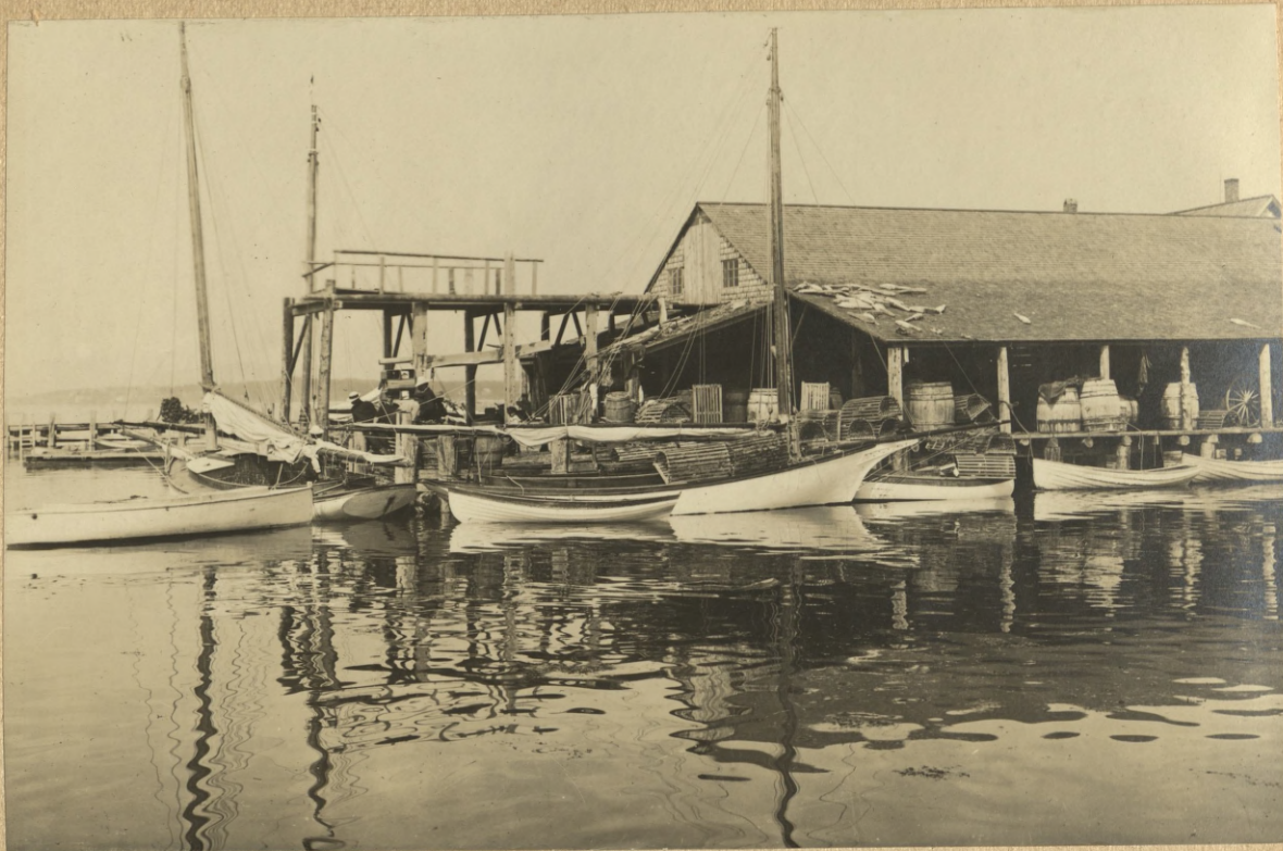
Fish Wharf. Isleford