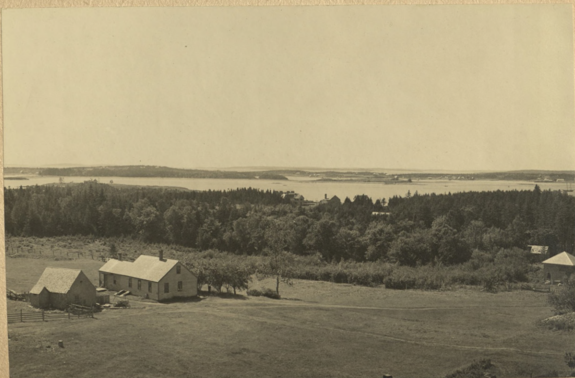
View south west from top of Hotel Lakeside. Tom Stanley's house below; "big cranberry" beyond.