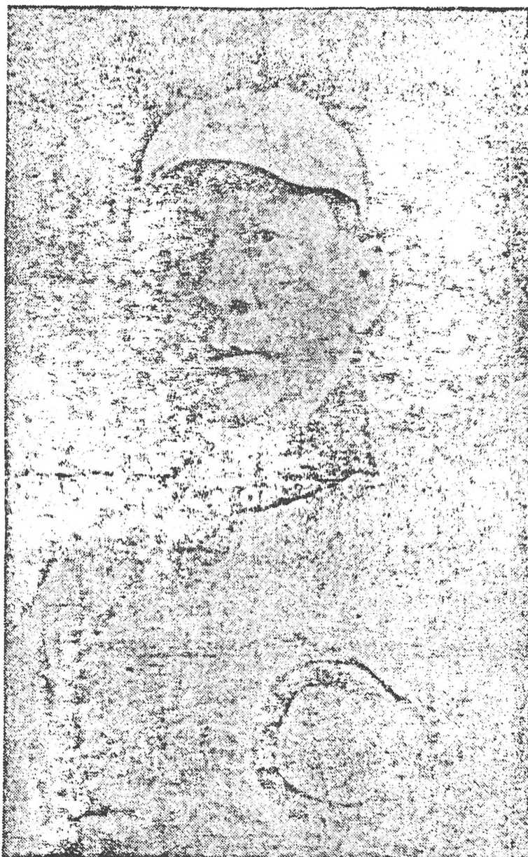
LOUIS SOCKALEXIS —This is the only available photograph of Louis Sockalexis of the old Cleveland Spiders who is rated by many experts as baseball's greatest player. Photo was taken after Sockalexis' retirement for a postcard sold to tourists who visit the Penobscot reservation in Old Town.