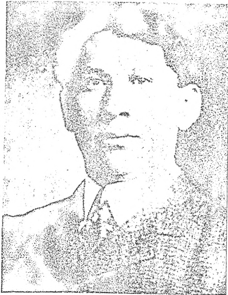
THE SOCK AT HIS PRIME — Louis Sockalexis is shown at his prime before leaving the East to join the Cleveland baseball team. Powerfully built he stood five feet eleven inches tall and weighed 197 pounds in his youth.