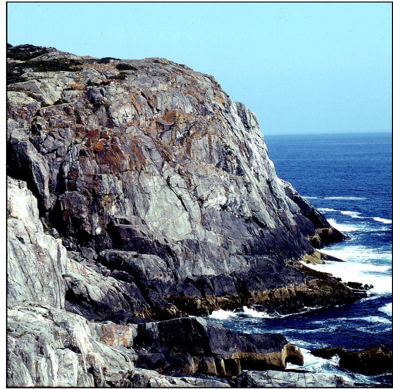
No bluff with a ledge shoreline. A steep slope on the bedrock surface is not a bluff. On this map, bluffs must be made of sedimentary material, generally with 3 feet or more relief. This shoreline type is very slow to change.