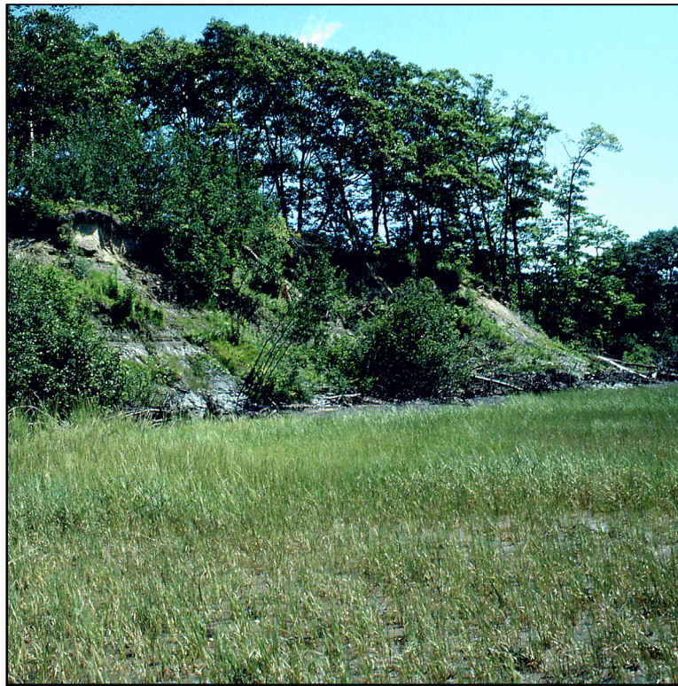
Unstable bluff with a partially vegetated bluff face and a salt marsh shoreline. This bluff, protected by a salt marsh, remains unstable. There are small bushes on the bluff as well as small non-vegetated areas that indicate continuing bluff retreat.