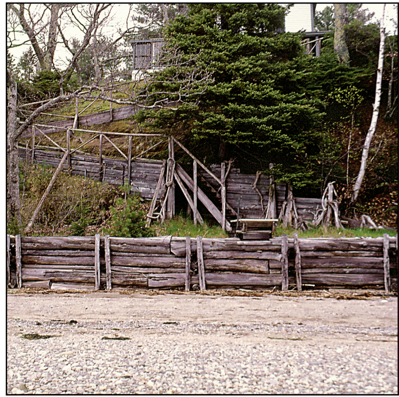
Stable bluff with a vegetated bluff face and an armored shoreline. The bluff face is fully vegetated and supports a mature stand of trees with vertical trunks. The presence of a wooden bulkhead suggests that erosion has occurred in the past.