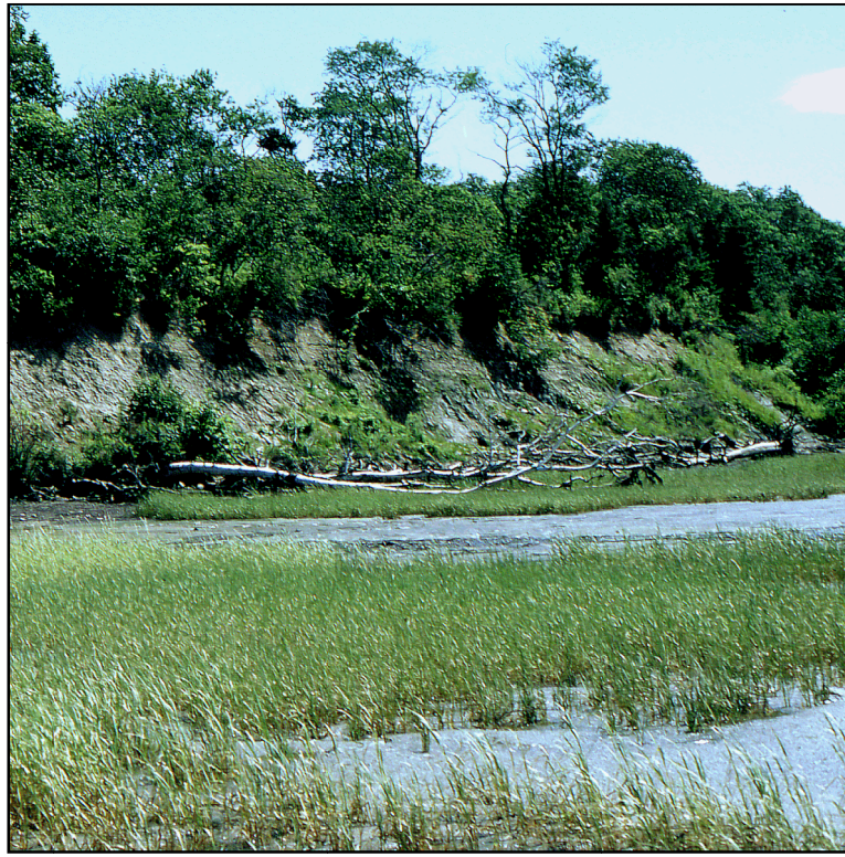
Highly unstable bluff with an unvegetated bluff face and a salt marsh shoreline. Sediments on the bluff face are exposed and fallen tree trunks lie at the base of the bluff. A salt marsh has recently formed on the tidal flat, partly on the top of an old landslide deposit.