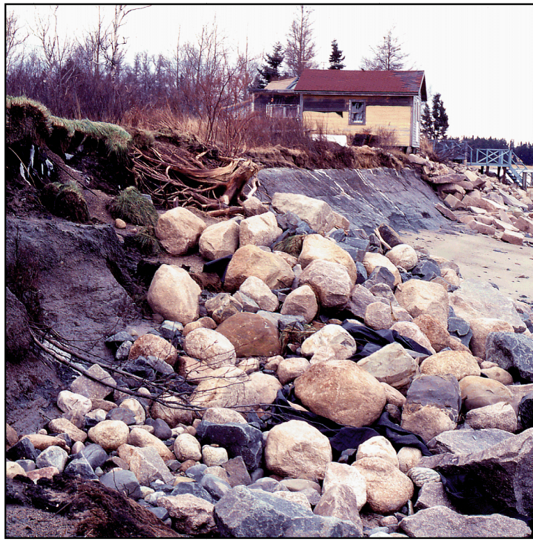
Highly unstable bluff with an unvegetated bluff face and an armored shoreline. This armored bluff is eroding despite an effort to shore it up with riprap, or loosely piled stone blocks. Maintenance at this site could improve bluff stability.