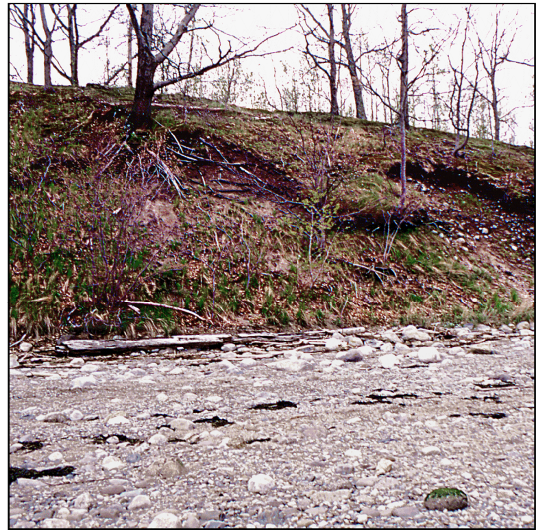
Unstable bluff with a partially vegetated bluff face and a beach/gravel flat shoreline. Slump scars on the bluff face expose sand, gravel, and roots. Fine sediments are removed by waves and currents, leaving gravel to form a beach at the base of the bluff.