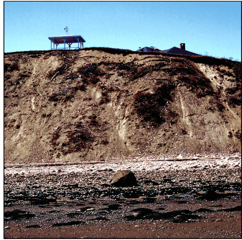
Highly unstable bluff with an unvegetated bluff face and a beach/gravel flat shoreline. The bluff face is too unstable to support vegetation. This bluff, a glacial esker, is eroded by waves to create a mixed sand and gravel beach in front of the bluff.