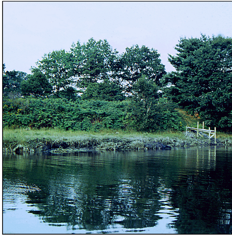
Stable bluff with a vegetated bluff face and a salt marsh shoreline. A low bluff face is covered by shrubs landward of a salt marsh terrace. In this location the mature marsh protects the base of the bluff from rapid erosion and slows bluff recession or retreat.