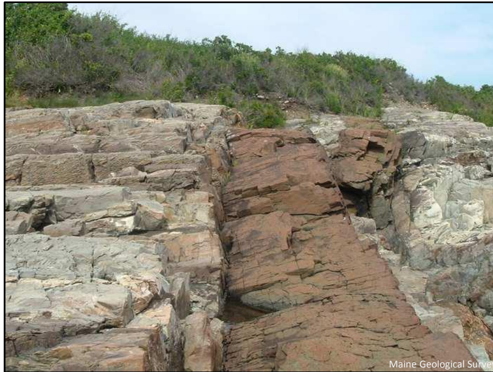
Figure 4. This brown-weathering dike intrudes across the bedding of the Kittery Formation.

Though they constitute only a small volume of the bedrock, the vertical sheets of basalt are easy to spot. They have a dark rusty-brown weathered surface, straight sides, and break into angular blocks (Figure 4). The dike is broken by a small fault, so that the dike in the foreground does not continue all the way to the vegetation, but is offset to the right. The fault creates an imperfection in the rock that is exploited by wave erosion to produce a small notch in the bedrock surface.