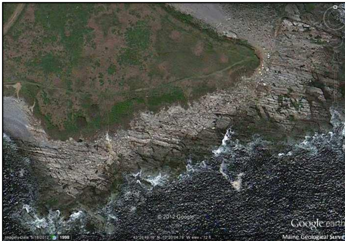
Figure 17. Site D. A large outcrop of ledge.

Site D is the large outcrop of ledge that extends to the point (Figure 17). It is dominantly Kittery Formation, intruded by a small body of granite toward the south end, and a large basalt dike just below the point of land. Many minor structural features such as folds and faults deform the bedding in the Kittery. The bluff at the point, though not very high, is extremely unstable.