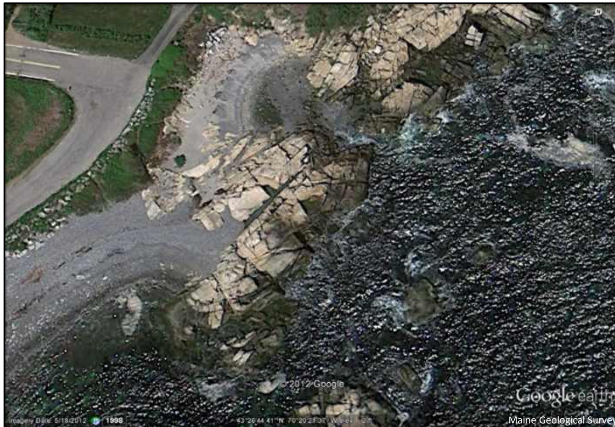
Figure 14. Site A. Area of Biddeford Granite bedrock.

Site A is an area of Biddeford Granite bedrock (Figure 14). This is the best place to inspect the granite. The granite contains fragments of the Kittery Formation, which sank into the molten rock before it solidified. Also, the granite is intruded by basalt dikes, which must be younger.