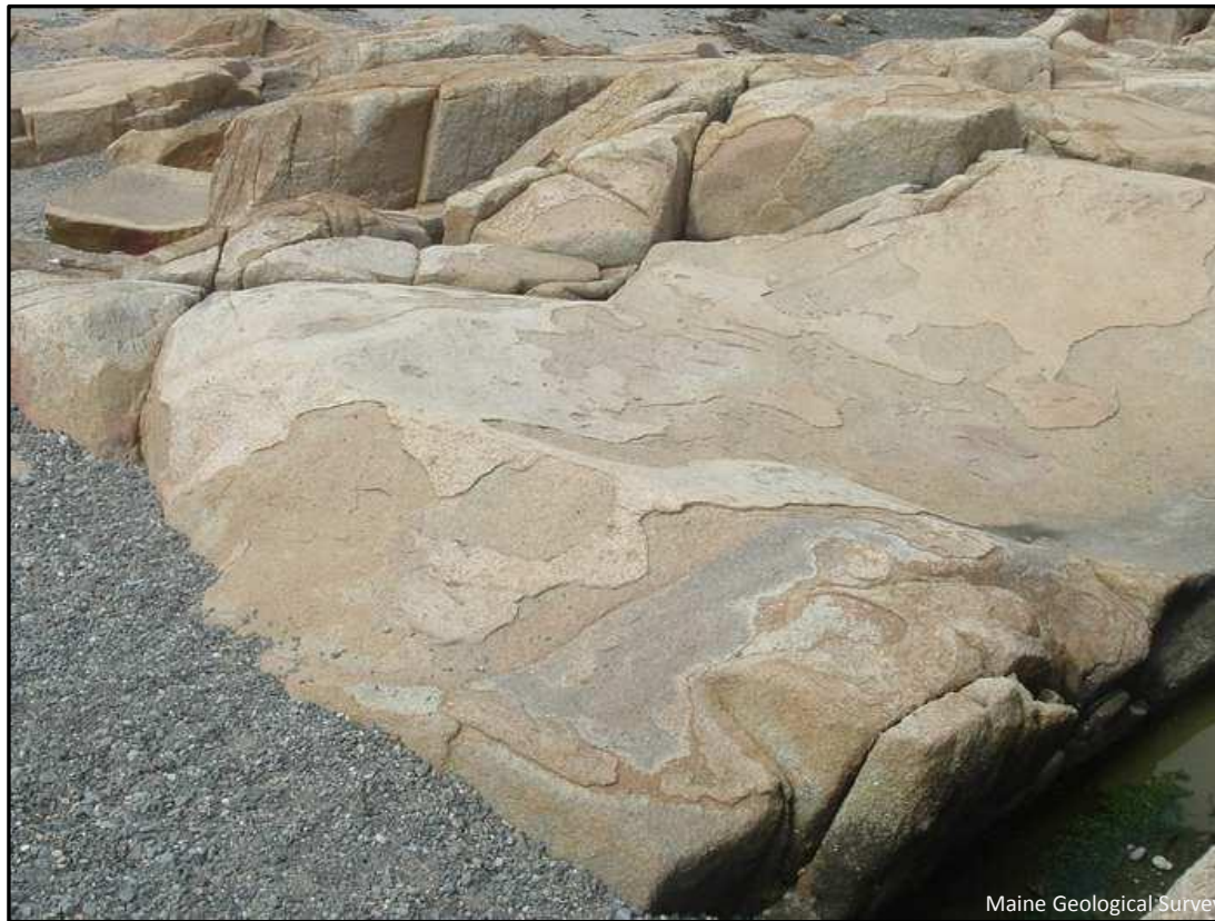
Figure 3. A uniform outcrop of granite bedrock exhibiting exfoliation.

Figure 3 shows a large, uniform piece of granite bedrock with no fractures. Expansion and contraction of the outer surface due to hot and cold weather cycles over time, causes the outer surface to break away from the underlying rock in thin sheets. This natural weathering process is called exfoliation.