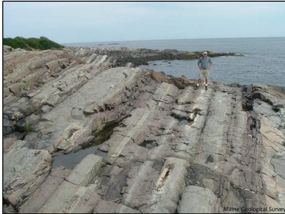
Figure 2. A beautiful outcrop of the Kittery Formation.

The wave-washed surface in Figure 2 displays the greenish-gray and lavender-gray layers that make up the formation. Although they are metamorphic rocks, the original sedimentary character is well preserved. Beds of sandstone and siltstone from 20 centimeters to over a meter in thickness are characteristic of the formation. Originally horizontal, the layers are now tilted steeply to nearly vertical. White, weathered pods are calc-silicate rock, which represents an impure limy sediment.