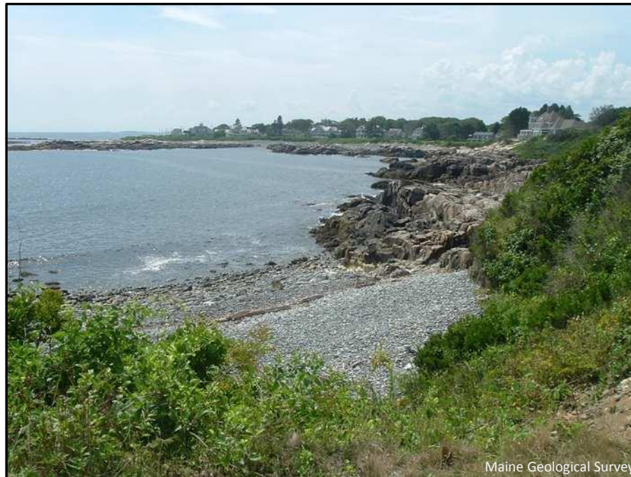
Figure 10. View toward the southwest from the path.

Modern geologic processes continue to shape the coast. Storm waves loosen and move blocks from the bedrock preferentially along structurally weaker zones such as dikes, faults, and fractures. Pocket beaches form in small recesses between rocky headlands (Figure 10). For some reason, the bedrock surface at this place has been eroded deeply enough that it is completely covered by sediment, mainly cobbles and pebbles. The bedrock headlands restrict the transport of beach sediment along the shore, which allows this beach to be quite different from the next beach to the south (Site A) which is on granite bedrock.