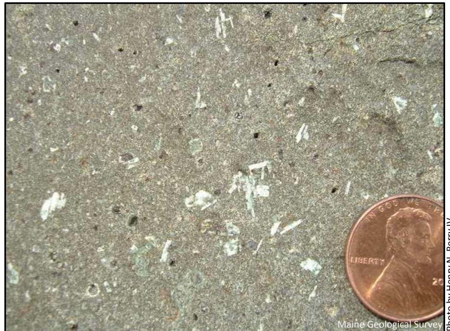
Figure 5. Close-up view of one of the dark-colored dikes where it is not covered by the brown weathering rind.

Each vertical sheet, called a dike, formed when magma filled a fracture as it was opening. The rock itself is a dark gray to black igneous rock that has very small grains, entirely visible only under magnification. In some places, the rock contains scattered larger grains of feldspar (Figure 5). This texture of two dominant grain sizes, is called porphyritic. A porphyritic texture may be produced by a two-stage crystallization process, in which the larger crystals began to form first, at a deeper level in the earth, and then the rest of the rock crystallized rapidly into very fine crystals at the time the dike was emplaced into colder rocks.