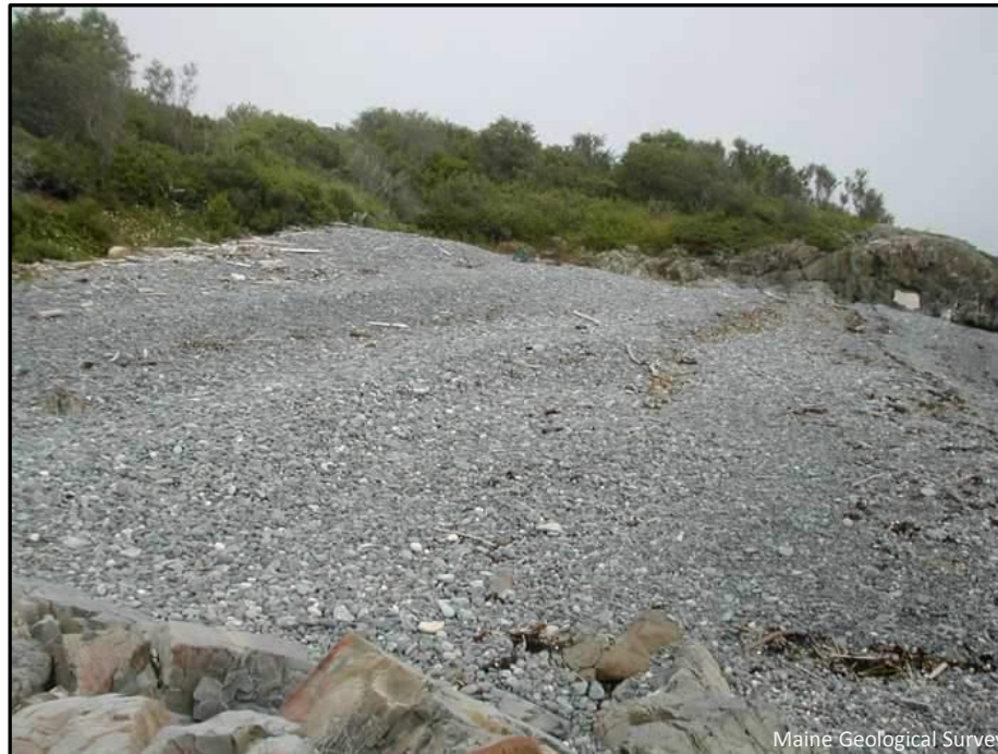
Figure 11. View of a pebble beach with storm berms.

The beaches may be made of sand or cobbles, but whatever the sediment it is moved by waves of sufficient energy up and down the beach face (Figure 11). Storm waves move the stones up the beach, leaving ridges, or "berms", at particular elevations. Lower berms are reworked by later storms, so the higher berms represent older storms. Most of the stones on the beach are light gray, greenish-gray, and lavender-gray rocks eroded from the Kittery Formation. Compare the color with the bedrock in the foreground, except that any chemical weathering stains are worn away from the cleaner beach stones by wave action.