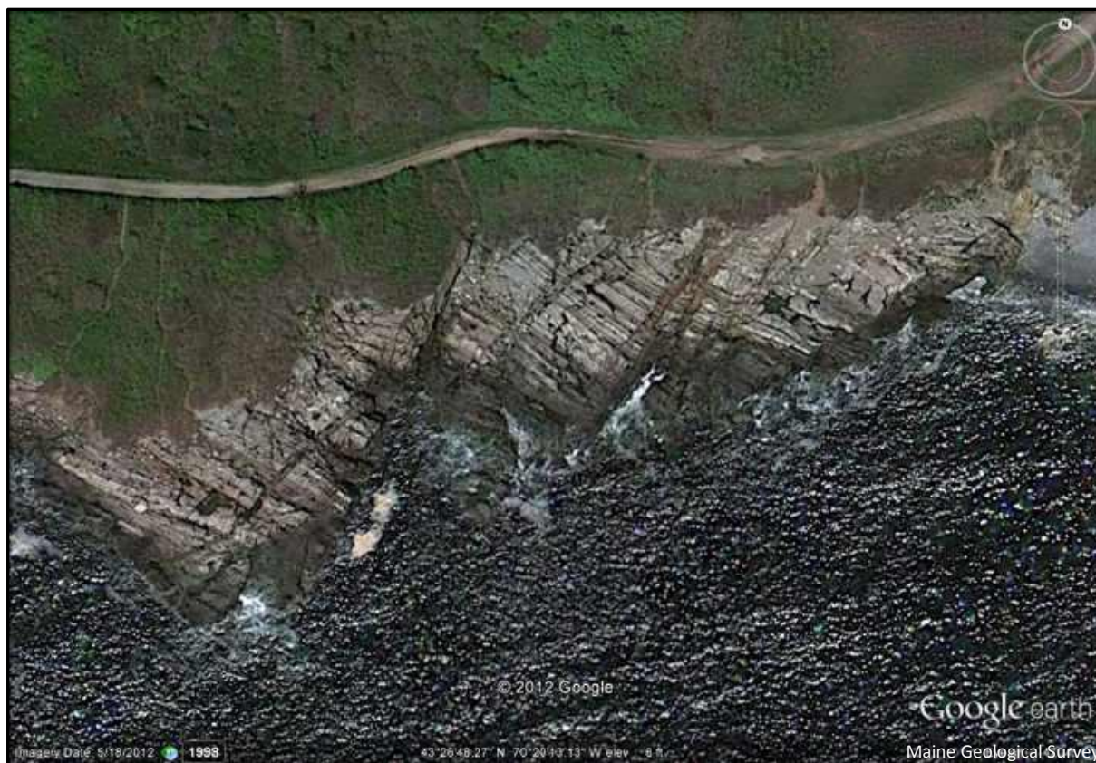
Figure 15. Site B. Area of Kittery Formation intruded by several basalt dikes.

Site B is an area of Kittery Formation intruded by several basalt dikes (Figure 15). This is the best place to see the dikes. A small body of granite intrudes the Kittery Formation near the north end of the outcrop, near the beach.