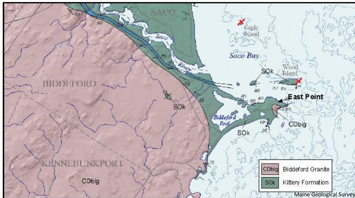
Figure 1. Local bedrock map, showing Biddeford Pool and East Point.

Figure 1 shows a portion of the bedrock map for the Biddeford area, including Biddeford Pool. The large main body of Biddeford Granite is roughly oval-shaped, approximately 6 miles by 10 miles across. Another small body of Biddeford Granite occurs along the coast east of Biddeford Pool, south of East Point. The bedrock at the point itself belongs to the Kittery Formation. In addition, dikes of basalt up to a few feet thick, are common, a few of which are represented on the map by red symbols. Many dikes of basalt intrude both the granite and the rocks of the Kittery Formation, as we shall see.