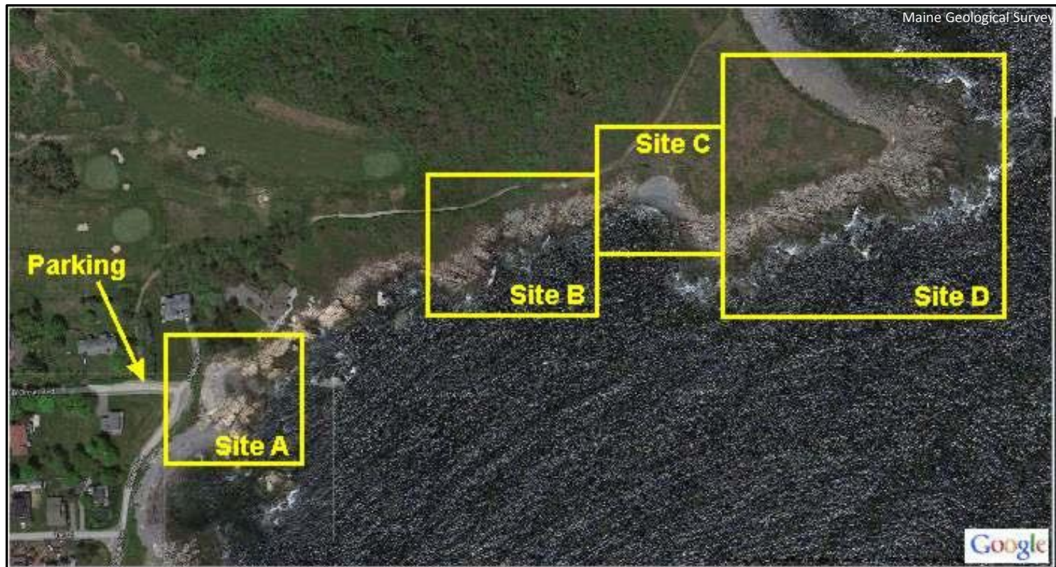
Figure 13. Index map of areas of geologic interest.

Four areas of geologic interest, labeled Site A through Site D, are indicated on the index map (Figure 13) and on the Google Earth file .