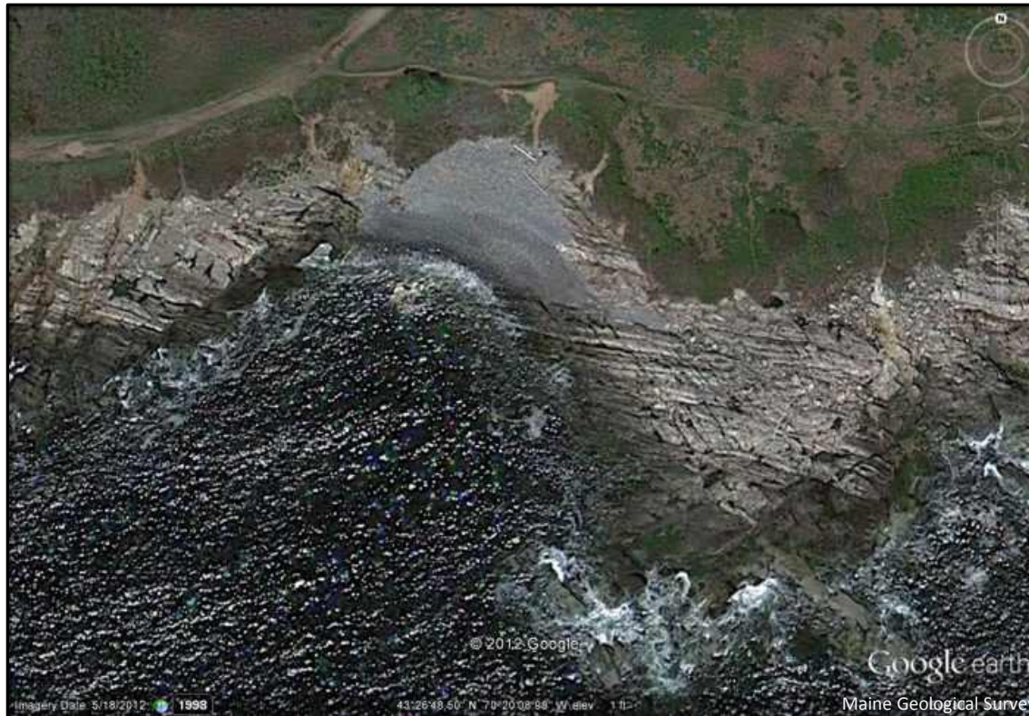
Figure 16. Site C. Pocket beach of smooth, rounded pebbles and cobbles.

Site C is a pocket beach made of smooth, rounded pebbles and cobbles (Figure 16). Most of the cobbles are light gray rock derived from the Kittery Formation, although some stones of granite and other rock types are mixed in. Notice the ridges (berms) at certain elevations, produced by storm waves. The bluff at the head of the beach is eroding, providing sediment to the beach.