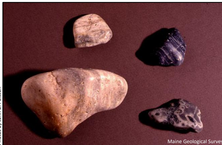
Figure 6. (Left) Beach pebbles of dark-colored volcanic rock. (Right) Beach pebbles of light-colored volcanic rock.