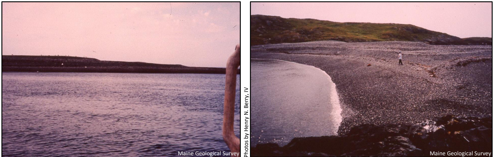
Figure 3. (Left) The beach is made up of deposits in a series of horizontal levels called berms. (Right) Each storm berm has a steeper lower slope and flatter upper slope. There are at least five storm deposits preserved here.

The stones on the beach are neatly arranged in a series of flat-topped deposits, (Figure 3, Left) called storm berms, that are stacked on each other. A view looking back along the beach (Figure 3, Right) from the end of the point shows that each berm has a steeper lower slope, a flatter upper slope, and a line of seaweed and other debris along its top edge. The next higher berm then repeats the shape: steeper lower, flatter higher, with debris on top.