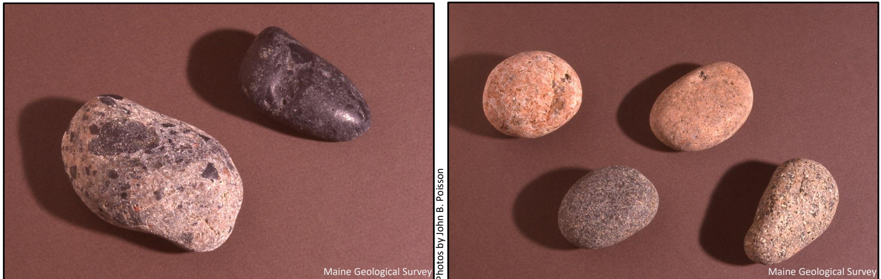
Figure 7. (Left) Beach pebbles of volcanic rocks containing broken rock fragments. (Right) Beach pebbles of different types of granite.

The obvious place for the stones to have come from is the bedrock next to the beach. After all, every stone was once part of some bedrock before it was broken loose.