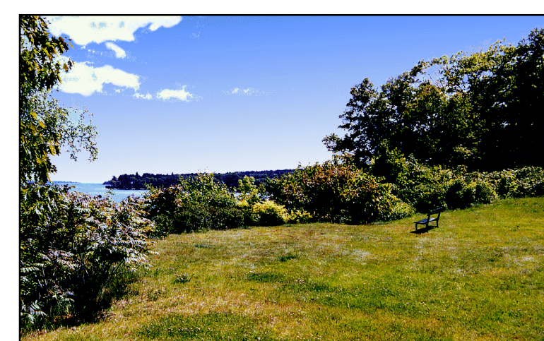
Figure 3. The shape of the top edge of a bluff can be an indicator of landslide risk. Clay bluffs often fail at points of weakness. Such a "slump" can expand into a larger landslide that cuts into the bluff and forms a curve around the original point of failure. Multiple slides and slumps will form an irregular or arcuate top edge to the bluff as shown in the photo above. Bluffs made of coarse materials or sand have a more even upper edge caused by a more constant rate of erosion along the bluff face.