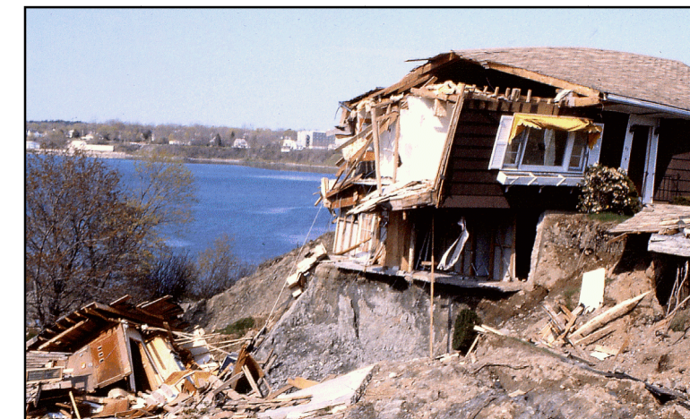
Figure 1. A clay bluff on the north shore of Rockland Harbor failed in 1996. This landslide formed a new scarp about 200 feet landward of the original top of the bluff in just a few hours. Two homes were destroyed as a result of this catastrophic slide (see Berry and others, 1996).

Sea level is gradually rising along the coast of Maine (Kelley and others, 1996). This rise in the ocean allows waves to erode beaches and flats at the base of coastal bluffs (see Figure 2A). Over time, erosion removes material from the base of a coastal bluff and steepens the face of the bluff (Figure 2B). Sediments at the base of the bluff stabilize it, and when they are removed, the bluff is no longer in equilibrium. Only the strength of the material within the bluff holds the bluff in place. Continued erosion or lubrication of the bluff materials by ground water may overcome this internal resistance, particularly in clay bluffs, and result in a landslide (Figure 2C). A landslide restores the equilibrium of the bluff, and the slumped materials landward of the bluff support a new bluff face with a gentler profile (Figure 2D). Erosion, however, is a continuing process because the level of the sea is rising, and coastal waves and currents immediately begin to remove the edges of the displaced sediment. Eventually, erosion destroys the equilibrium of the bluff and leads to another landslide, repeating the cycle shown at right.