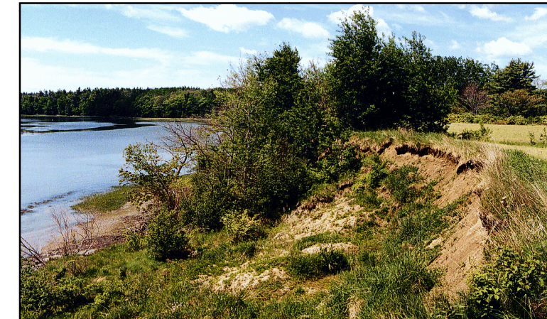
Figure 5. Terraces on a hummocky land surface on the slope of a bluff can indicate a former landslide. Terraces can be the surface of downsloped blocks which moved during a slide. Vegetation on the surface of these blocks may be tilted in various directions. The irregular land surface may also occur in a bowl-shaped depression below an arcuate top edge of the bluff, additional evidence of a former landslide.