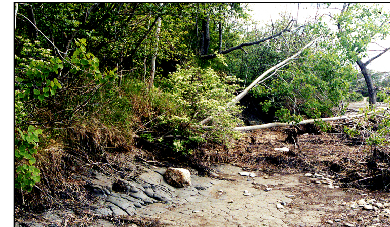
Figure 7. Wave erosion at the base of a bluff undercuts the trees in the photo above and causes them to tilt toward the ocean. This steepening reduces the stability of the bluff, and a landslide may result. Ongoing sea-level rise along the Maine coast will cause wave erosion at the base of coastal bluffs and continue to make some coastal bluffs at risk of experiencing a landslide.