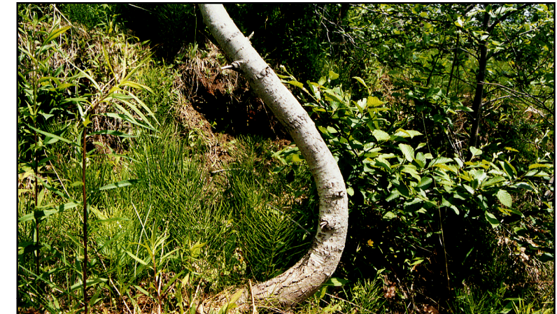
Figure 6. Soil "creep" or downslope movement of soil on a slope, causing tree trunks to tilt toward the base of the slope. As a moving tree continues to grow, the trunk will curve as the forces to the right increase.