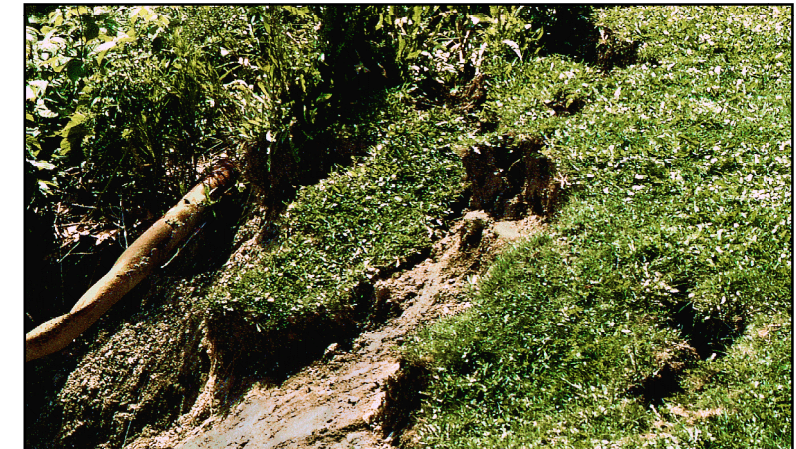
Figure 4. Downslope forces within a bluff cause surface layers to stretch. When the tension becomes great enough, a crack forms and the stress is released. These "tension cracks" may form on the top edge of the bluff or on the bluff slope itself. They indicate instability and motion within the bluff. Some cracks are deep and extend below the soil layer.