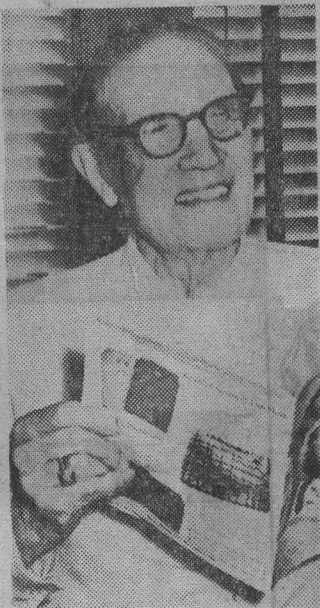
Author and Book

"I showed them the store orders and said I figured, seeing as how the stores were buying the soap, they ought to buy a carload of the stuff to re-stock