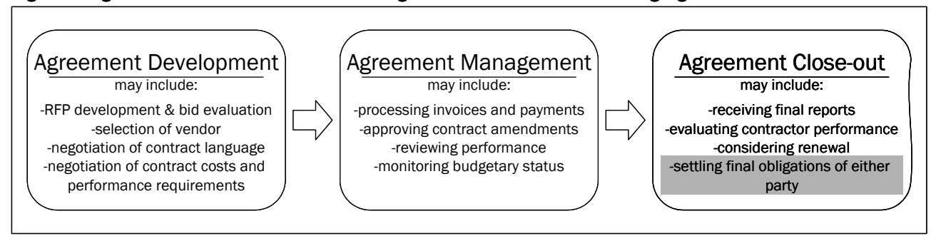
Figure 2. High-Level Overview of DHHS' Contracting Process with OPEGA's Focus Highlighted

When they end, agreements for human services undergo a close-out or final settlement process. This may include delivery of final reports required under the agreement terms and/or a financial settlement to ensure that the dollars paid during the agreement's life have been appropriate and allowable. Any remaining balances owed to either party should be resolved at this time. This financial settlement portion of the close-out phase was the focus of OPEGA's review.