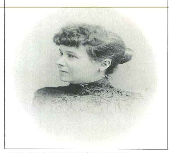
Someone's Cousin, Presently Unnamed...

Individuals seeking worldwide coverage (or home access) may always subscribe on their own, and details are available by logging on to the main site