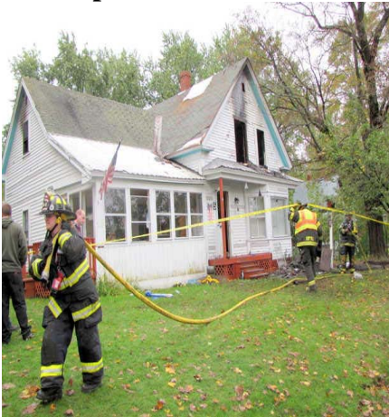
Richmond Home Fire

A very young child is believed to have accidentally started this fire in Richmond below. Over the past couple months a number of fires believed to have been started by children have been reported.