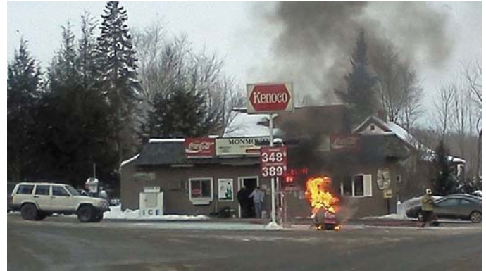
Monmouth Snowmobile Fire

Check out this hot snowmobile below. The operator of the snowmobile had put gas in it and when he attempted to start it up the fire ignited. The owner of the station was out of business until the suppression system on the pump could be recharged.