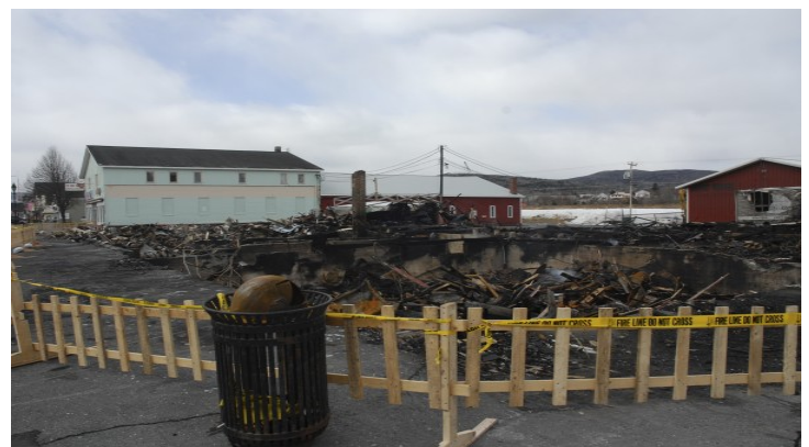
Ft. Kent Fire

Perhaps no fire demonstrates the cost of fire and value of fire codes more than the one that took place recently in Ft. Kent. The fire, pictured below,