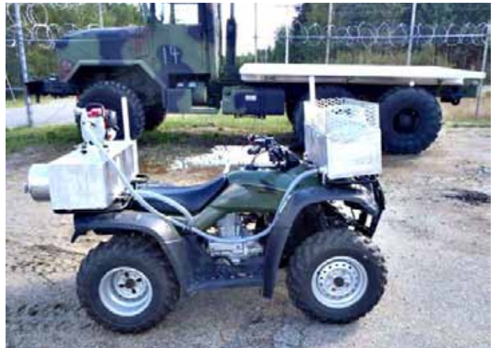
ATV's for the Machiasport Fire Department.