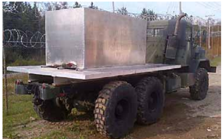
This tanker is a proto-type for Forestry—it's a 1,000 gallon water tank. Craig Smith has been working closely with Forestry developing a large capacity tanker for use in Maine's forests.