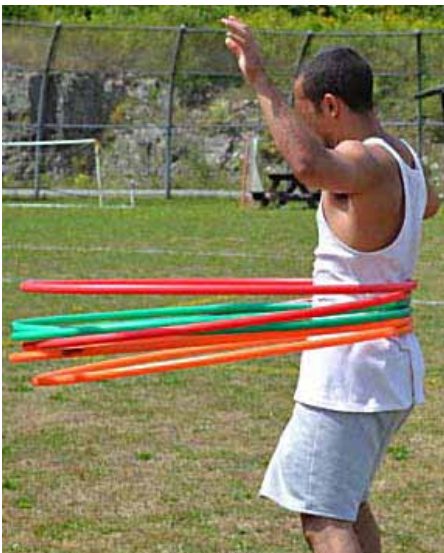
Slipping, Sliding, and Hooping it up!

including a slip and slide (the kids absolutely loved this—mud and all), a wading pool with marbles, and “Dunk Tank!” Lots of events and fun for all!