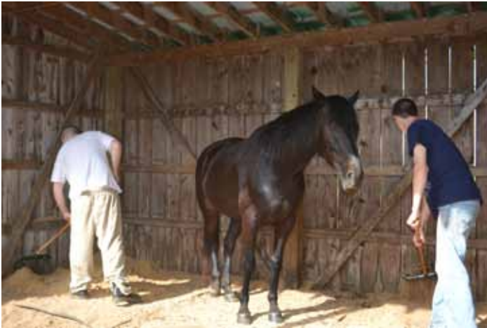
Mountain View students hard at work.