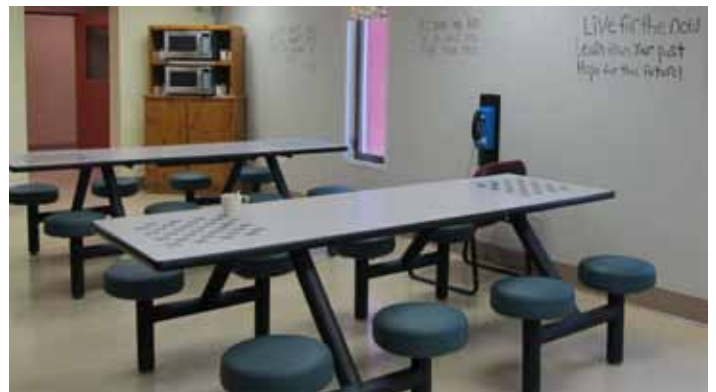
The new facility at the Southern Maine Re-entry Center