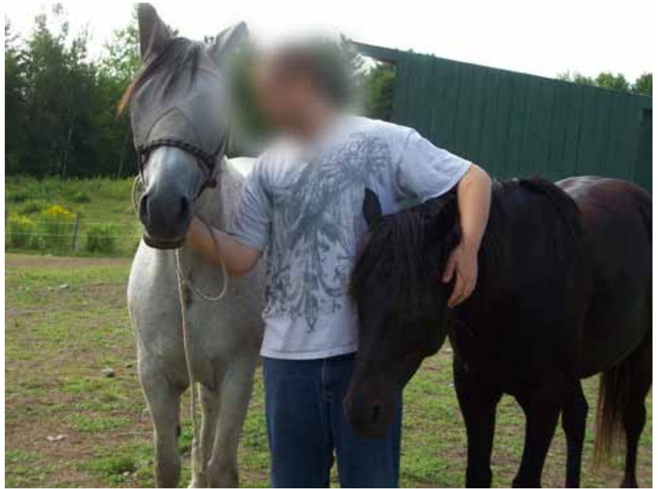
Mountain View youth participate in an equine program at Northern Maine Riding Adventures in Garland, Maine.

clean pasture and stall; and working with feel —using all the senses to understand the language of the horse. Our youth have a lot of emotions, which in part, are expressed through their body language. When they’re around these sensitive animals their emotions can easily impact the