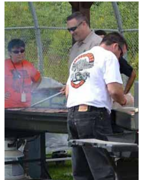
Summer means barbecue!