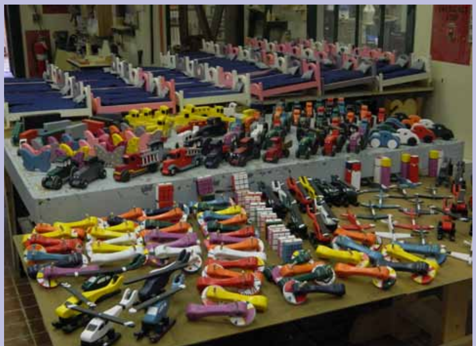
The "DCF elves" made a variety of wooden toys for distribution to children in the local community.