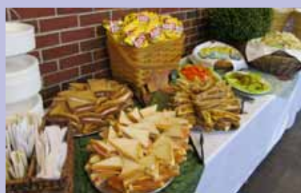
Lunch prepared by the women at the Southern Maine Re-Entry Center.