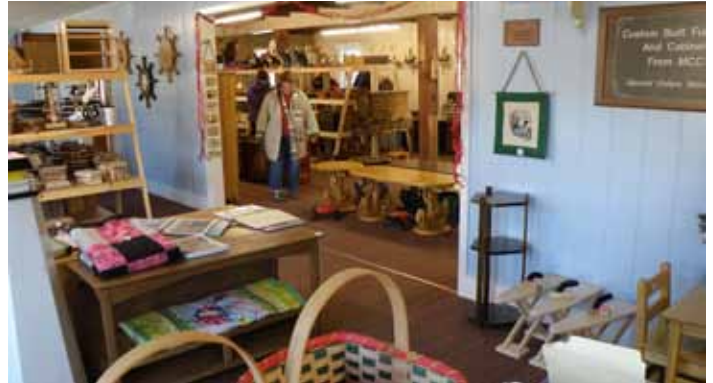
“Black Friday” sales at the Prison Industry showrooms surpassed last year’s sales.

25% increase over 2012 numbers allowing the Industries Program to finish the year up on a very good note.