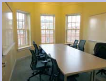
A conference room in the newly renovated third floor of the Williams building (Central Office).

Major accomplishments in the field include the relocation of Central Maine Pre-Release Center back in April. In May, a consultant was hired to evaluate the security/con-