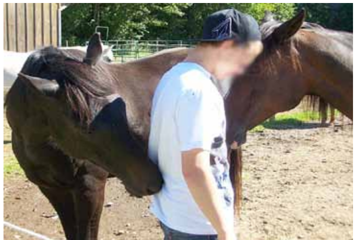
Mountain View Youth learn life skills by caring for horses.