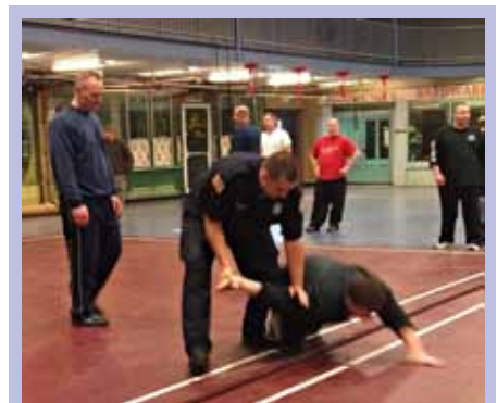
New DOC hires learning Unarmed Self-Defense in the Gymnasium at Maine Criminal Justice Academy.