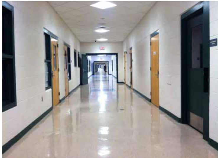
MVYDC's 780-Foot "Main Spine." Living Areas are on the right side, classrooms are on the left side.

In Corrections, facility occupancy is measured by beds. MVYDC, for example, has 133 beds; room for