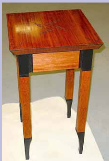
The Fine Furniture Craftsman Program at Maine State Prison is going strong.