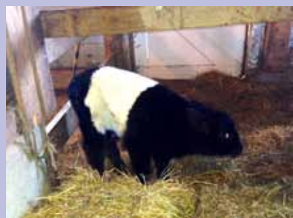
One of two Belted Galloway calves born in September at Bolduc Correctional Facility.

Maine Integrated Risk Reduction Model (MIRRM) training will kick off in 2014 with PO Magnusson and PO Burnham representing Region 3 and contributing their skills as trainers.