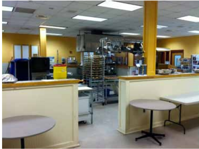
Residents take culinary arts classes in Mountain View's kitchen.