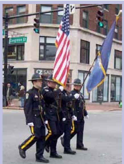
Maine Department of Corrections Honor Guard. Veterans Day Parade. Portland, Maine.