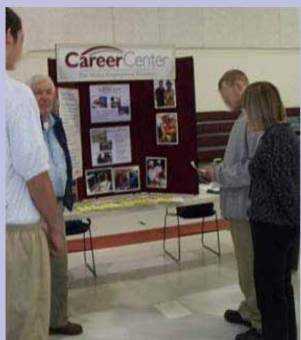
Residents attend Job and Career Fair held at Mountain View Youth Development Center. Among the vendors participating was the Maine Career Center.

residents of Mountain View and adult inmates of Charleston Correctional Facility (CCF). It was a huge success with eleven vendors representing colleges, employers, and career centers. Separate opportunities provided juveniles and adults to speak directly with organizations to assist them with re-entry jobs and college plans. This event was the first for Maine corrections facilities and was covered by local news media.