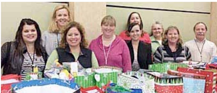
Volunteers at Long Creek Youth Development Center prepare Christmas gift bags for the residents.

This year the Volunteers at Long Creek Youth Development Center, focusing on the theme “Christmas Around the World,” sponsored a gift drive which brought in donations from area non-profits, businesses, and churches.