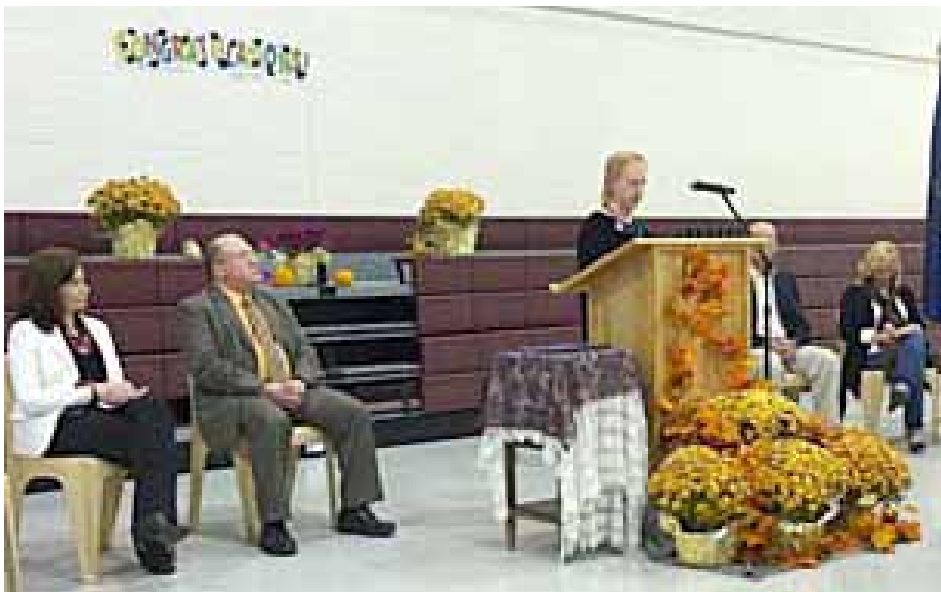
Mountain View Youth Development Center Graduation on November 8, 2013.

engines in various stages of assembly are set out on work benches. "Staff will bring in equipment and the kids will do the work. Staff pay for all parts and things like that through the business office. It gives the kids the opportunity to work on different pieces of equipment: 4-wheelers, snowmobiles, boat engines, chain-saws. They take care of all the mow-