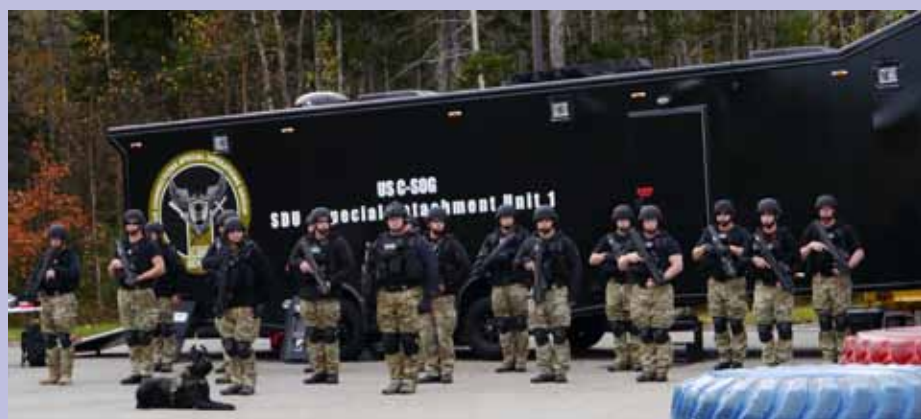
Maine DOC officially said goodbye to the old school tactics and technology of yesterday. The new Special Operations Group (SOG) Team (formerly the CERT team) includes members from the Maine Correctional Center, Maine State Prison, and Mountain View Youth Development Center.