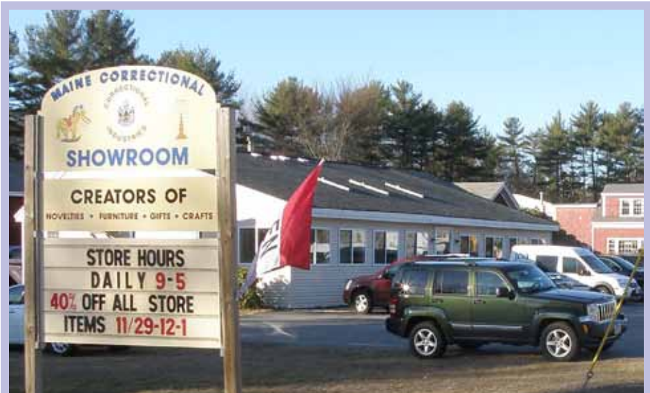
On Memorial weekend Correctional Industries opened a new showroom in Windham.