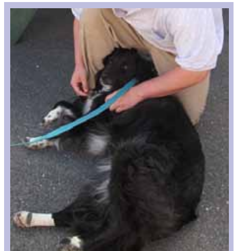
Duchess the Therapy Dog visits Mountain View Youth Development Center to bring a smile to everyone's face.

substance abuse among Maine youth to help them live productive, healthy and rewarding lives. Day One provides substance abuse treatment to the residents of Long Creek and Mountain View. For more information: day-one.org .