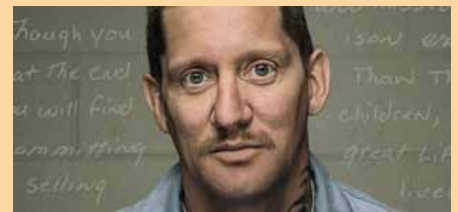
"REFLECT: Convict's Letters to Their Younger Selves" is an artistic documentation of choices, consequences, and reflection.