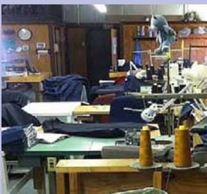
The Downeast Correctional Facility shop where blue jeans garments are made.